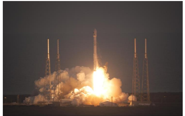
DSCOVR successfully launched on February 11, 2015 and is America's first operational deep space satellite. It provides higher-quality measurements of solar wind conditions, helping us monitor potentially dangerous space weather events.